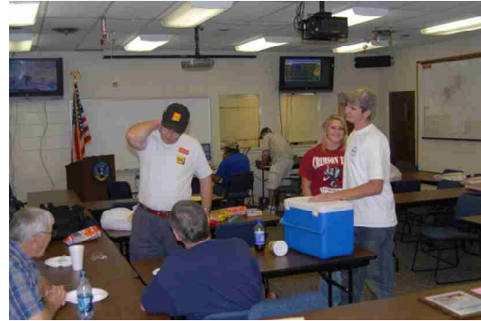
This is the Lee County Club-W4LEE